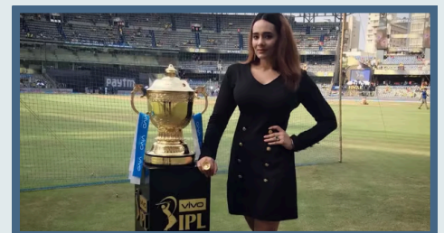
Sports presenter Mayanti Lange

The Symbiosis Institute of Media and Communication (SIMC) in Pune